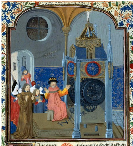
Clock Repair by King Soloman

In another painting By Titian from the "Book of Hours", the noblest of Virtues Temperance is wearing a clock on her head. The clock symbolizes moderation, discipline and control of emotions. In a bid to control it, Temperance is standing on top of a windmill, symbolizing uncontrolled passion.