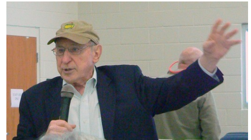
Brookes Auctions Donated Items