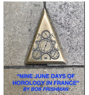
Besancon Tour Marker