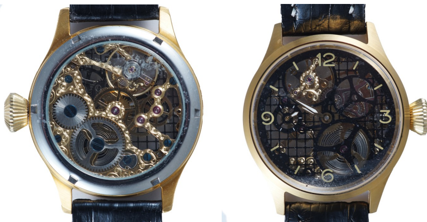
Right: Skeleton Dial