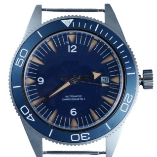
Above: Omega Blue Ocean “Homage”