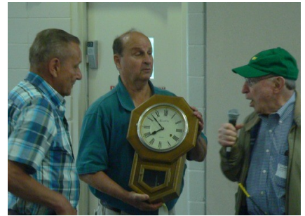
Auction Team Brooks