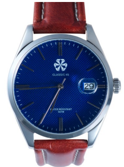
Finished “Kit” Watch