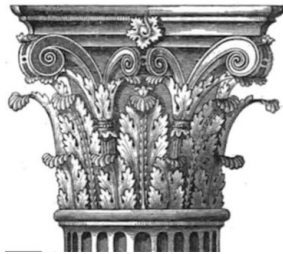
Corinthian Column Capital

The new clock case design was patented in 1816 by Lemuel Curtiss, who apprenticed with the Willards. An original Curtis sold at auction in 2013 for $578,000! After the Curtis girandoles, few, if any, were made until Walter Durfee reintroduced the design in 1908.