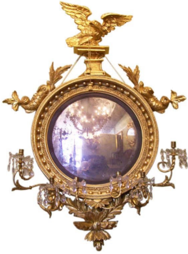
A Girandole Mirror

Girandoles are elaborate and rare clocks. The original design was inspired by girandole mirrors, which have an eagle final and acanthus leaf base. Acanthus leaves have been used in architecture since 450 BC when an Athenian architect and sculptor Callimachus is believed to have been the first to apply carved acanthus leaves growing around a votive basket on columns now known as "Corinthian".