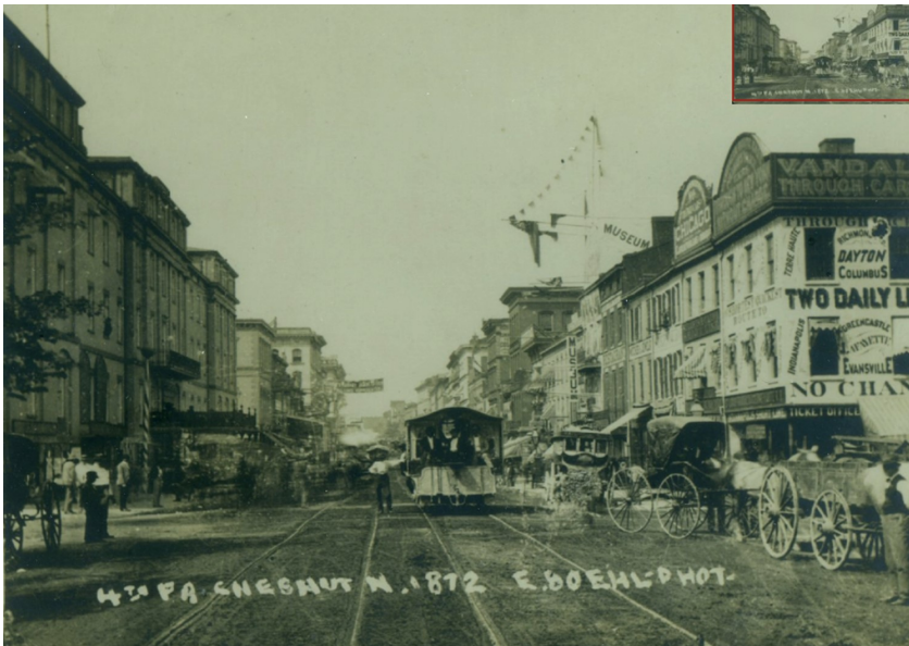
Vandalia Line Ticket Office, 4th and Chestnut, St Louis 1872