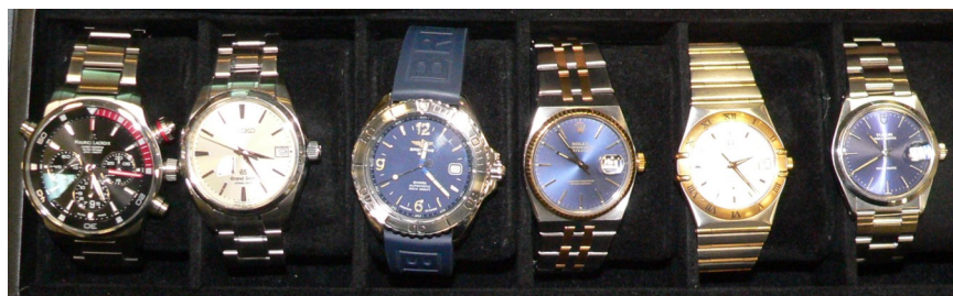
Grand Seiko, Breitling "Shark" and Rolex Oyster among other timepieces