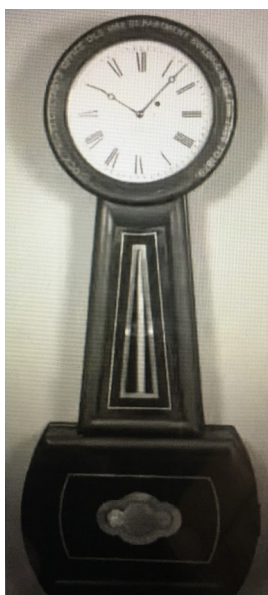
Lincoln E Howard

This E Howard #2 Banjo hung in the office of William Stanton, Secretary of War to President Abraham Lincoln. Lincoln spent many hours with Stanton in day-to-day management and prosecution of the Civil War from this office.