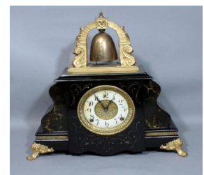
Gilbert Curfew Clock