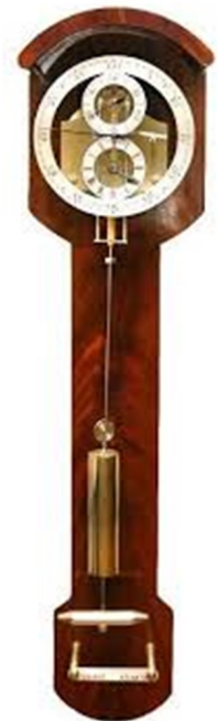
Bernie's Precision Regulator