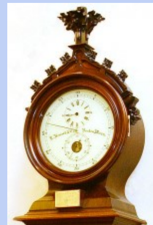
GA State Capitol's E Howard 22