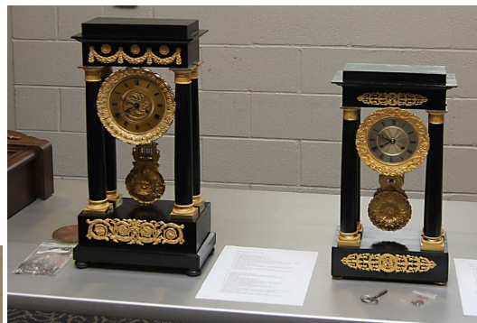
State French Portico Restorations