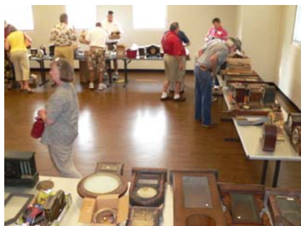
MINUTES OF CHAPTER 24 MEETING for August, 2008